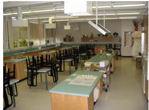
Abby Senior's new state of the art foods room.

The new computer lab completed this past week. This is one of the last sections of the school to be finished as part of the recent renovation.